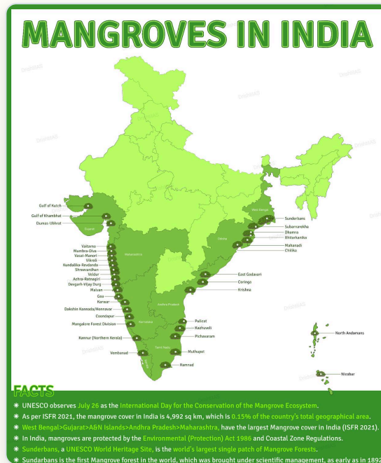
Major mangrove sites in India. As per ISFR 2023, India's mangrove cover is ~4,992 sq km (0.15% of geographical area).