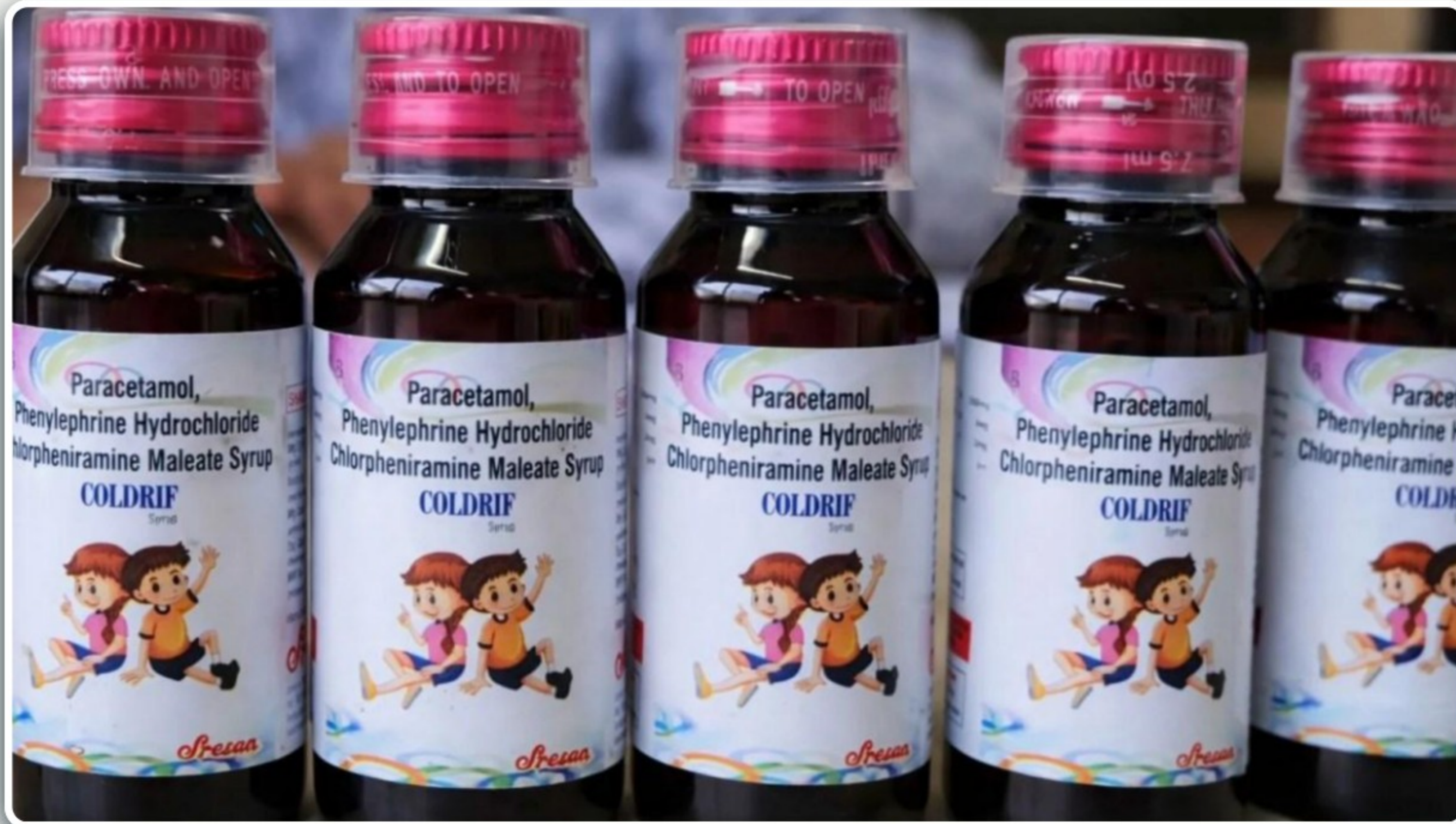
Adulterated cough syrups have been linked to multiple child deaths in India and abroad.

By a government notification, medicinal syrups — including cough syrups — can no longer be bought without a doctor's prescription . Over-the-counter (OTC) sale of such syrups will no longer be allowed.