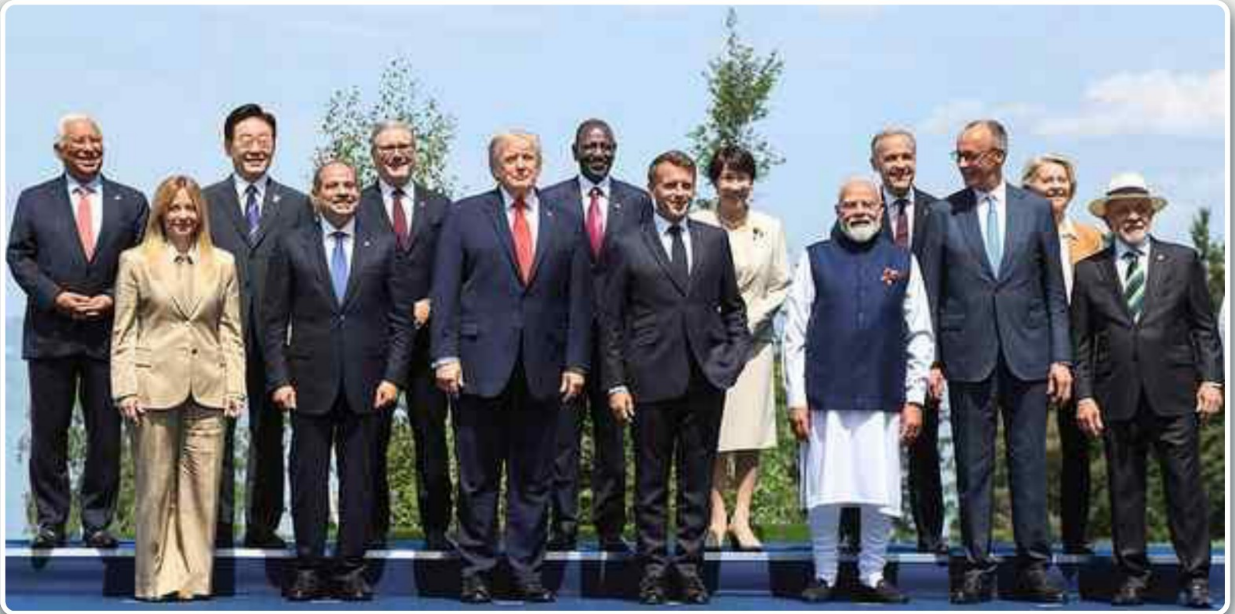
PM Modi with G7 members and outreach-country leaders in Evian, eastern France.

PM Narendra Modi participated in a G7 outreach session on “ Forging New Partnerships and Rebuilding International Solidarity ”, stressing that the world today suffers not from a shortage of resources but from a shortage of trust .