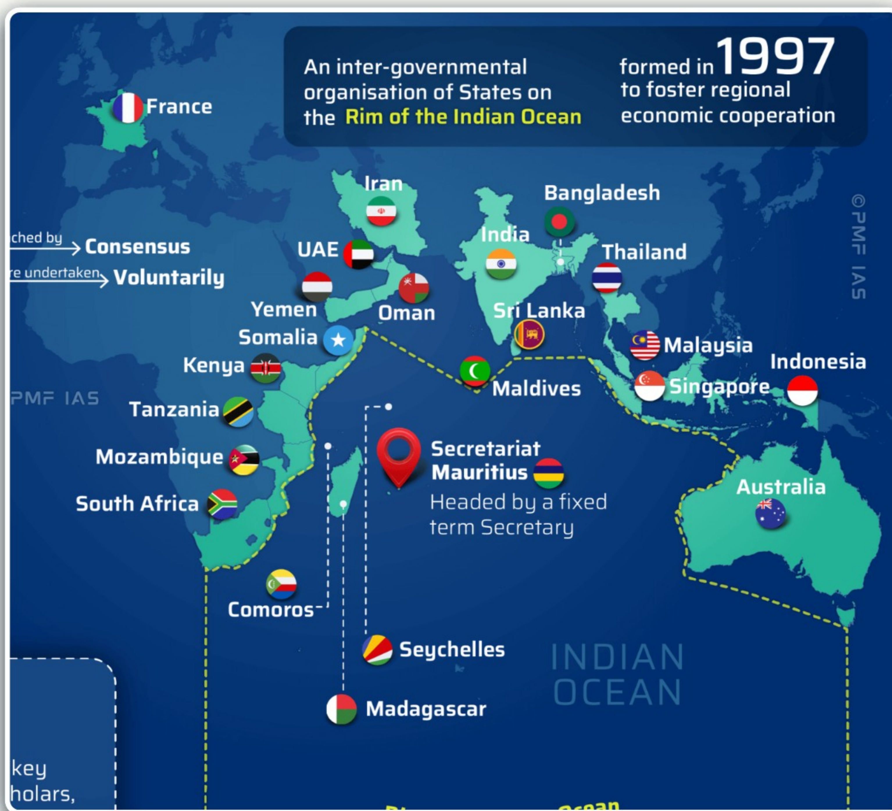
IORA — an inter-governmental organisation of Indian Ocean rim states, formed in 1997.