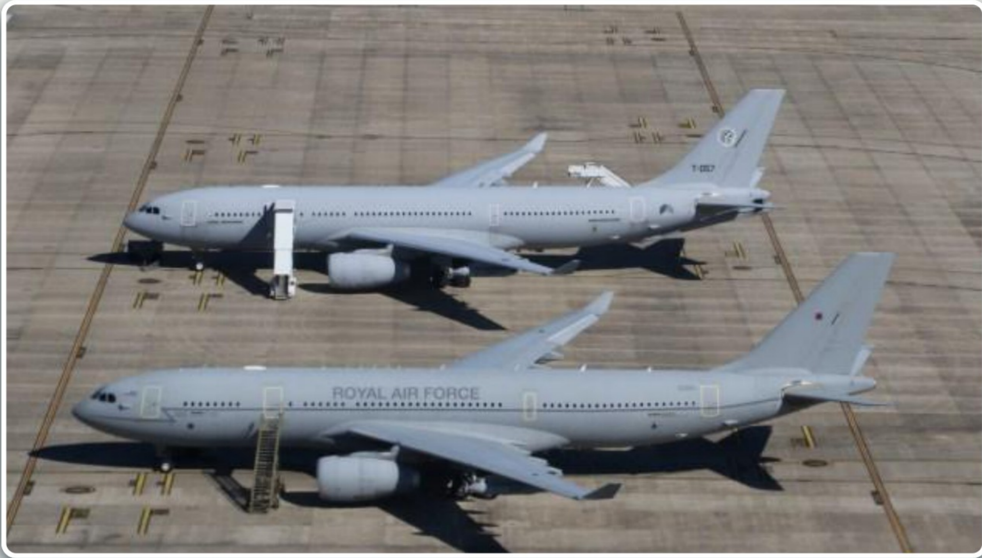
Air-to-air refuelling tankers — Pitch Black is the RAAF's largest international exercise.

The Indian Air Force (IAF) will participate in Exercise Pitch Black 2026 , the Royal Australian Air Force's (RAAF) premier multinational air-combat exercise, to be held in Australia's Northern Territory from 20 July to August .