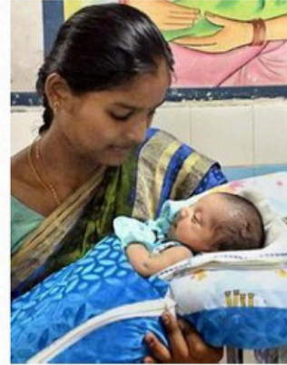
Under-5 deaths dropped from 127 per 1,000 live births in 1990 to 27 in 2024.

Also, the Under-5 Mortality Rate (U5MR) witnessed a sharp fall – in 1990, the U5MR stood at 127 per 1,000 live births,