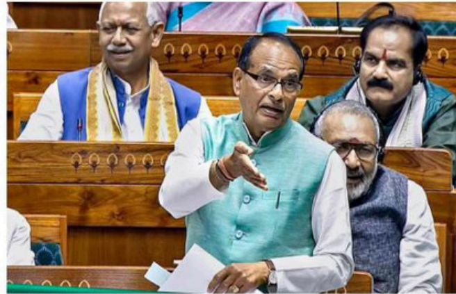
Union Minister Shivraj Singh Chouhan speaking in the Lok Sabha during the second part of the Budget Session of Parliament.

Replying to the debate on agriculture, Agriculture Minister Shivraj Singh Chouhan said the Centre is committed to transform society and shaping the future of the nation. He said the Opposition presented half-truths in the name of farmers' welfare. He said during the United Progressive Alliance (UPA) government, out of 140 major irrigation projects, 99 remained stalled.